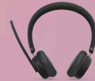
Lenovo Dual-Mode Wireless ANC Headset 6550 (USB-C, Teams) 4XD1S19778